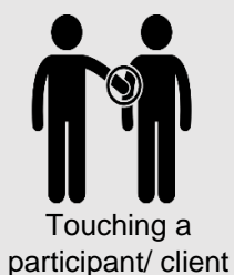
Touching a participant/ client